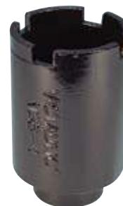
MODEL V38-4 SOCKET CONCEALED