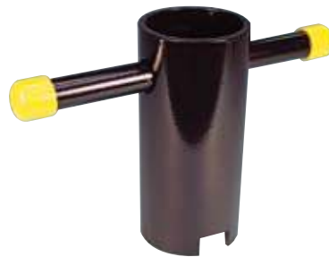
MODEL V38-5 OR MODEL V29-1 TEE HANDLE SOCKET