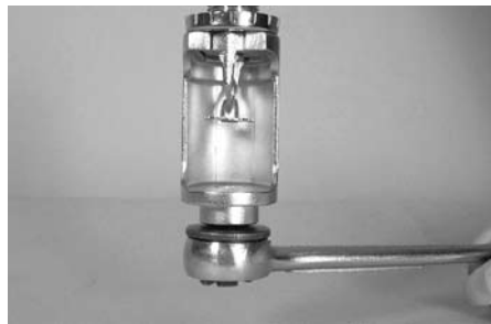
CORRECT ENGAGEMENT FOR MODEL V34 RECESSED WRENCH

Failure to follow these instructions could cause damage to sprinkler components, resulting in improper spray pattern, leakage, non-operation, and property damage.