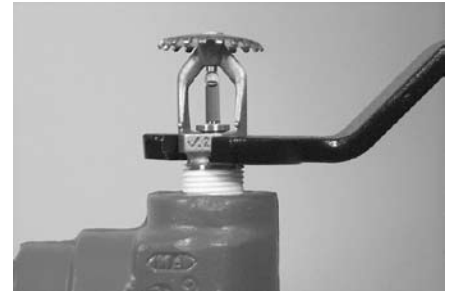
CORRECT ENGAGEMENT FOR MODEL V27 AND MODEL V34 OPEN-END WRENCH