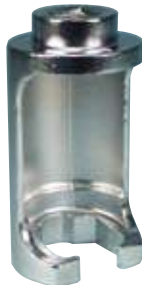
MODEL V34 RECESSED