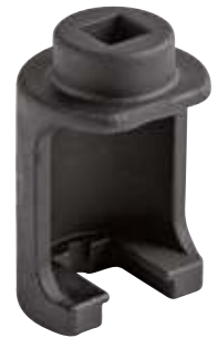
MODEL V39 CONCEALED