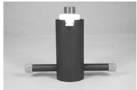
CORRECT ENGAGEMENT FOR MODEL V29 SOCKET WRENCH