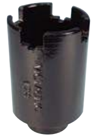
MODEL V29 CONCEALED