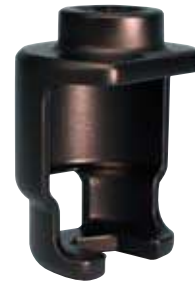
MODEL V27-1 RECESSED

In addition to standard offset open end wrenches, there is a socket for some sizes and open sided specialized wrenches for recessed or concealed installation.