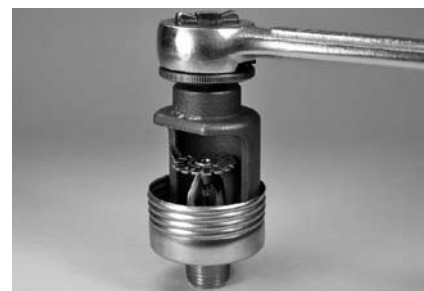
CORRECT ENGAGEMENT FOR MODEL V39 WRENCH ON V27 CONCEALED SPRINKLER