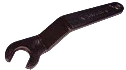
MODELS V34 & V36 OPEN END (USED WITH MODELS V34 OR V36 SPRINKLERS)