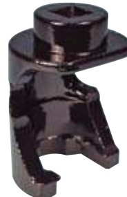
MODEL V36 RECESSED/CONCEALED (USED WITH MODELS V36 OR V39 SPRINKLERS)