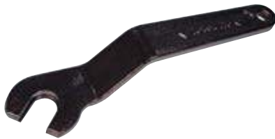
MODEL V27 OPEN END