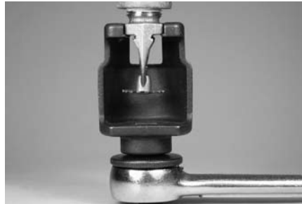
CORRECT ENGAGEMENT FOR MODEL V27-1 RECESSED WRENCH

Failure to follow these instructions could cause damage to sprinkler components, resulting in improper spray pattern, leakage, non-operation, and property damage.