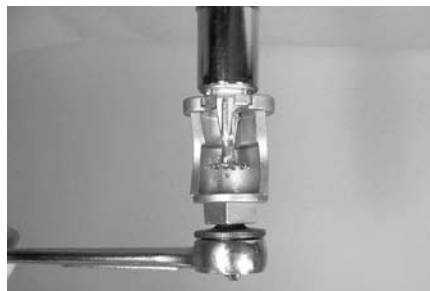
CORRECT ENGAGEMENT FOR MODEL V36 RECESSED WRENCH